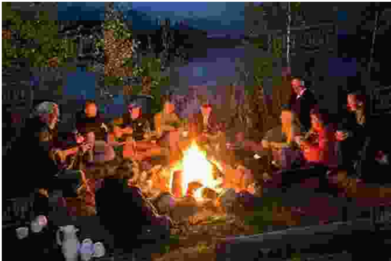
Image: A Bohemian Family Gathering

Within these bohemian communities, the traditional concept of family underwent a profound transformation. Free love and experimental relationships led to diverse family structures, including polyamory, group marriages, and communes where children were raised collectively. These unconventional family arrangements challenged the patriarchal norms and societal expectations that had long defined family life in America.