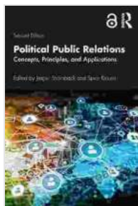
Image Alt Text: "Concepts, Principles, and Applications: Routledge Communication Series" book cover, showcasing the book's title and authors.

Free Download your copy today and embark on the path to becoming a master communicator.